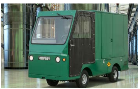
Note: Vehicles in photos show optional equipment.

The BIGFOOT EE offers a large operator's compartment with adjustable steering and seating which increases legroom and reduces operator fatigue.